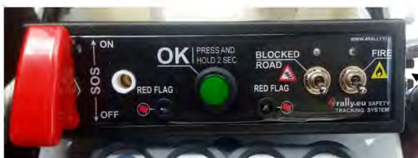
User Console – in reach of both crew members