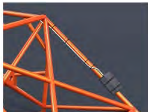
Connecting Cable – routed on inside of roll cage in order to avoid damage in event of car rolling etc.