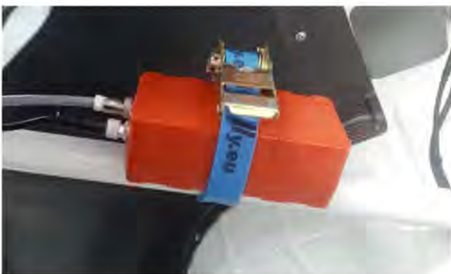
Receiver / Transmitter Unit

The receiver / transmitter unit is fixed to a bar of the roll cage in the rear of the car (using a small ratchet strap which is supplied) and the console is mounted in the centre front of the car such that both crew members can, both see and reach it, while belted in their seats . The connecting cable is then ran to the receiver / transmitter unit in the rear of the car, generally being cable tied ( cable ties not supplied ) to the bars of the roll cage. In routing the cable, care should be taken to ensure that the cable is fixed to the inside of the roll cage bars in order that it is not damaged in the event of an accident where the body panels are pushed against the roll cage.